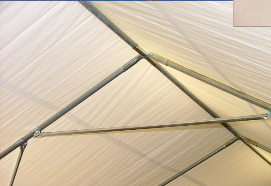
60" Roof Truss for 1 3/8" poles