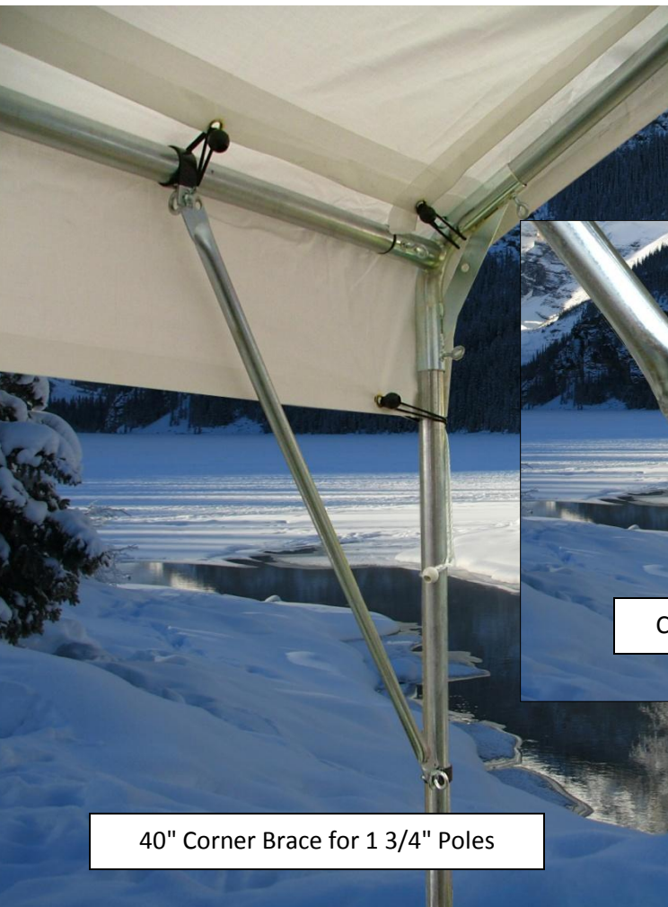
40" Corner Brace for 1 3/4" Poles

Extra braces and trusses further strengthens your frame against the elements.