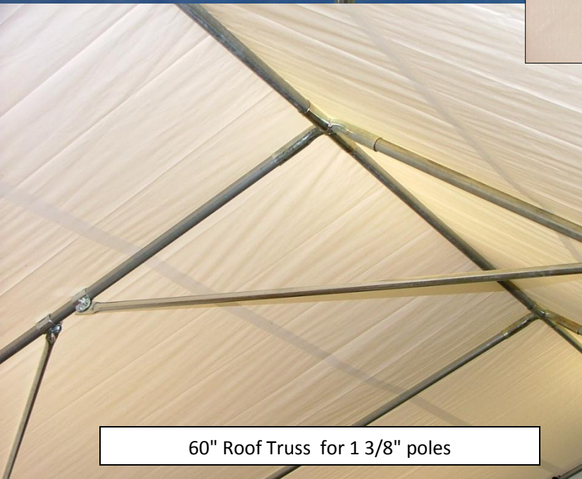
60" Roof Truss for 1 3/8" poles